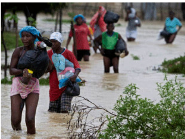
Recent hurricanes leave thousands of the most vulnerable Haitian citizens homeless.